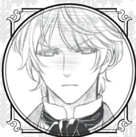
Cedric Jean Ellmeyer

The empress dowager of Imperial Ellmeyer. Pierre's mother.